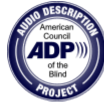
Audio Description Project logo